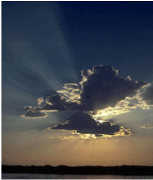
Christianity is not only a belief, but it is a commitment to way of life.

In the Triune God: Father, Son, Holy Spirit