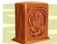
God Hears Every Prayer.