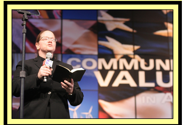
Heartland Presidential Forum, Des Moines, Iowa, December, 2007